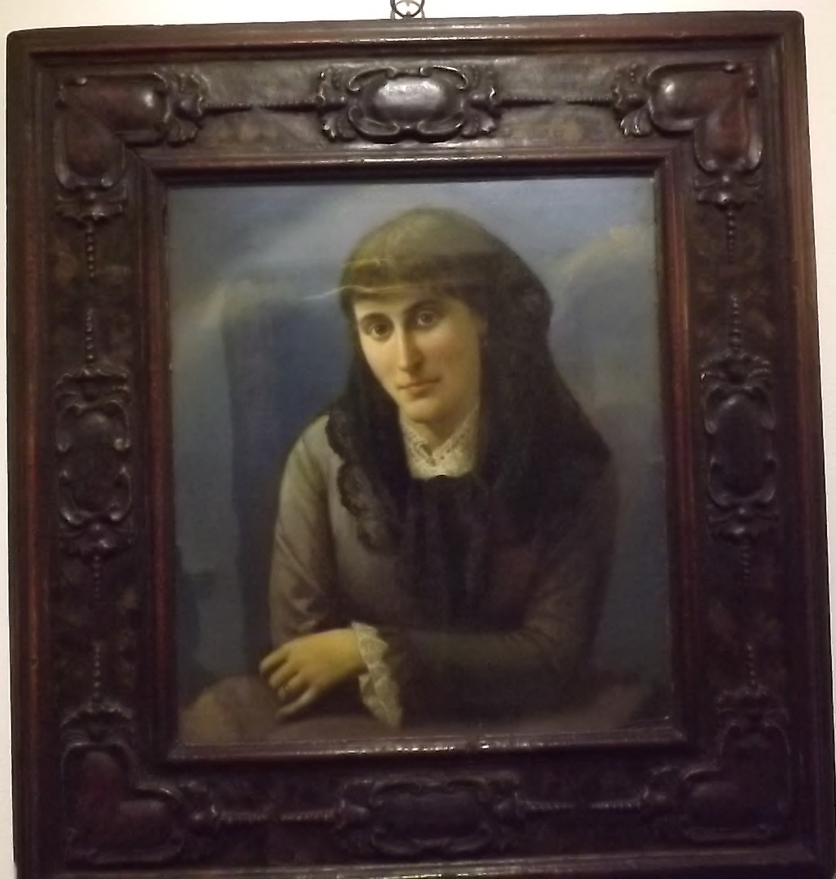
Portrait of a woman, likely a religious figure, wearing a dark, heavy garment with a white lace collar and cuffs. The painting is set within a dark, ornate wooden frame.