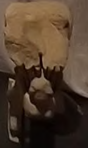
Small white marble fragment or detail of the main statue, possibly a head or a small figure, displayed on a stand.